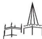
St Mary's Church Purton

15 'If you love me, keep my commands. 16 And I will ask the Father, and he will give you another advocate to help you and be with you for ever – 17 the Spirit of truth. The world cannot accept him, because it neither sees him nor knows him. But you know him, for he lives with you and will be in you.