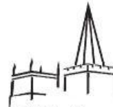
St Mary's Church Purton

Sat 11 July – Sing 4/4 Concert in St Mary's Church 7.00pm