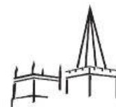
St Mary's Church Purton

Come and see the wonderful Christmas Trees for yourself! Come to St Mary's Church any time from Sunday Dec 3 onwards throughout the month, to enjoy the Purton trees! Look around and enjoy the spectacle. Every tree will be so different. Each has been created by different people, groups, organisations from the village and they are a wonderful sight! There are so many contrasting ideas. Please come and support the event. You are so welcome. The Church will be open every day as usual, from 9am-5pm (or thereabouts) so please just walk in and enjoy. If you come on Sunday afternoon Dec 17 you may hear the Peartree Pealers as well, (2.30-3.30) and there may even be a cup of tea for you to enjoy at the same time! (When there are Services taking place in the church we would be grateful if you didn't walk around...maybe wait until the end of the Service.)