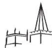
St Mary's Church Purton

We praise God for the awesome majesty of the heavens; for advancing technology which allows us to see it in ever greater detail. We pray for scientists, engineers and technicians, for wisdom and insight, that all their work would be towards the greater good and give glory to the One who made it all. "By the word of the LORD the heavens were made, their starry host by the breath of His mouth." [Psalm 33:6]