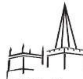
St Mary's Church Purton

16 Then the eleven disciples went to Galilee, to the mountain where Jesus had told them to go. 17 When they saw him, they worshipped him; but some doubted. 18 Then Jesus came to them and said, 'All authority in heaven and on earth has been given to me. 19 Therefore go and make disciples of all nations, baptising them in the name of the Father and of the Son and of the Holy Spirit, 20 and teaching them to obey everything I have commanded you. And surely I am with you always, to the very end of the age.'