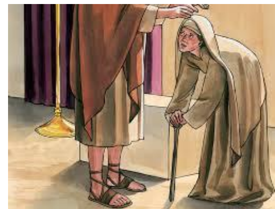
Jesus heals a crippled woman on the Sabbath