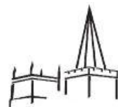
St Mary's Church Purton

Sat 11 July – Sing 4/4 Concert in St Mary's Church 7.00pm