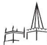
St Mary's Church Purton

This is a great opportunity for our young people to meet others in small youth groups like our own, as well as for our congregation to support our young people and others being served by SYFC!