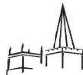
St Mary's Church Purton

Sat 11 July – Sing 4/4 Concert in St Mary's Church 7.00pm