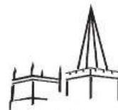
St Mary's Church Purton

Admission free; donations invited. No booking required