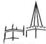
St Mary's Church Purton

Sat 11 July – Sing 4/4 Concert in St Mary's Church 7.00pm