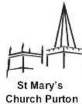
St Mary's Church Purton